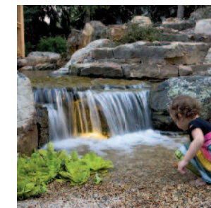
Pondless Waterfall* ☐ $10,000