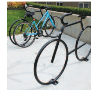
Bicycle Rack ☐ $1,000