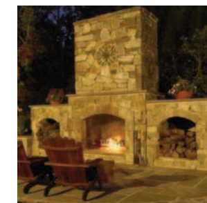
Outdoor Kitchen* ☐ $25,000