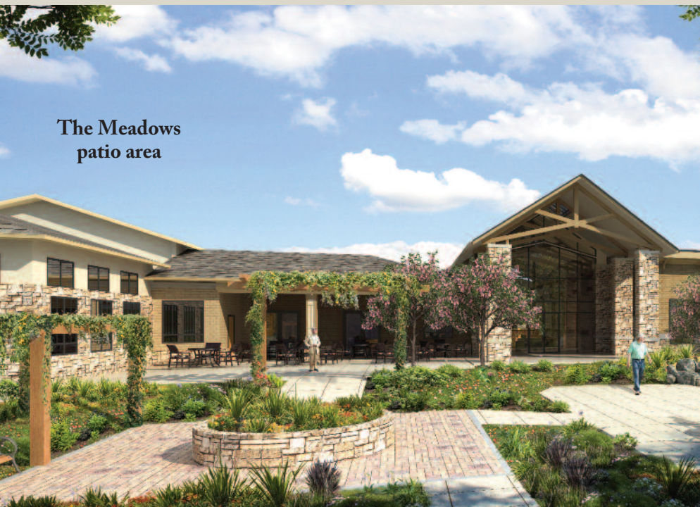
The Meadows patio area