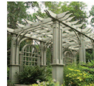
Trellis* ☐ $5,000