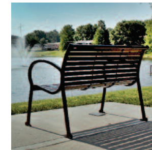
Meadows Bench ☐ $1,000

The Foundation is proud to offer additional opportunities to make a lasting impression. If you have questions or ideas for additional sponsorship opportunities, please contact the Foundation office at 816-347-2384 .