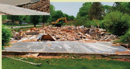
Crews have been working to demolish homes on Craigmont and Lake Spurr for future phases of the Villa initiative.