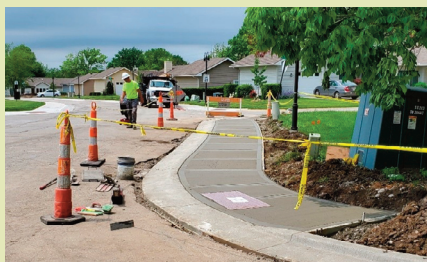
The length of Peace Parkway, which runs from Pryor Road to Moore Street, is getting new concrete curbs and sidewalks. The first phase of the project was completed last fall.