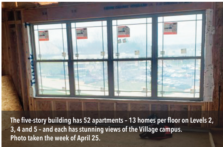
The five-story building has 52 apartments - 13 homes per floor on Levels 2, 3, 4 and 5 - and each has stunning views of the Village campus. Photo taken the week of April 25.