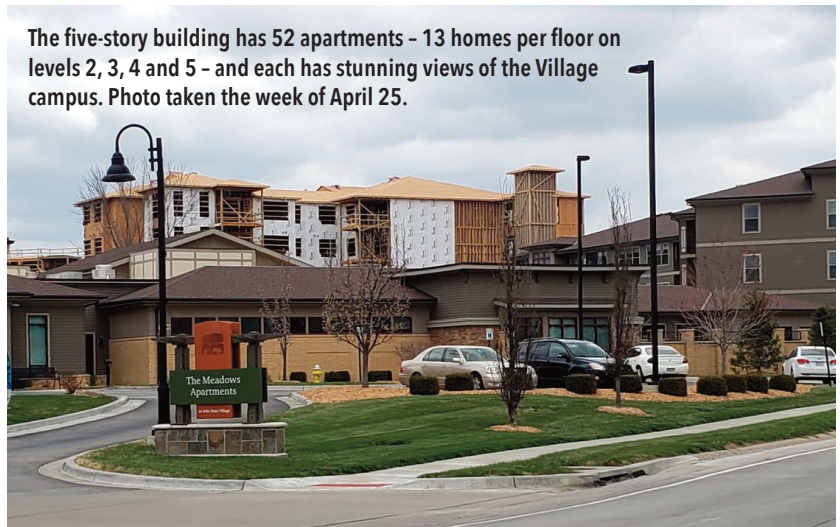
The five-story building has 52 apartments - 13 homes per floor on levels 2, 3, 4 and 5 - and each has stunning views of the Village campus. Photo taken the week of April 25.