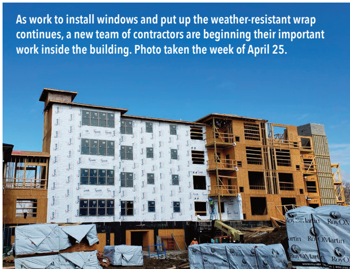
As work to install windows and put up the weather-resistant wrap continues, a new team of contractors are beginning their important work inside the building. Photo taken the week of April 25.