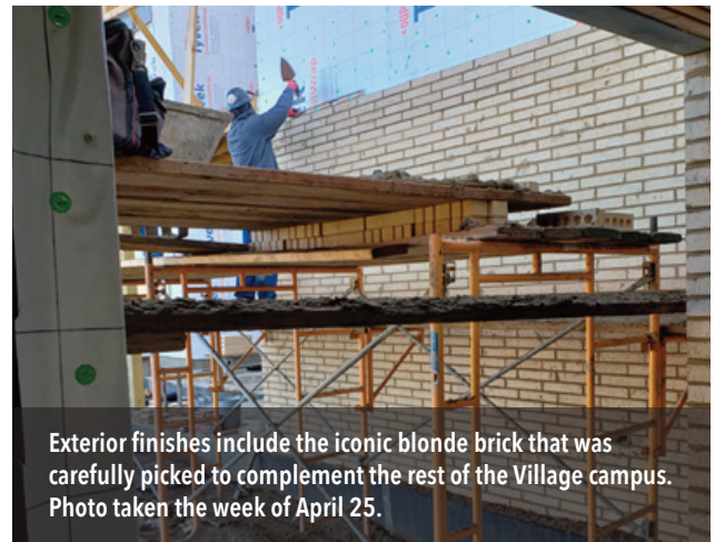
Exterior finishes include the iconic blonde brick that was carefully picked to complement the rest of the Village campus. Photo taken the week of April 25.